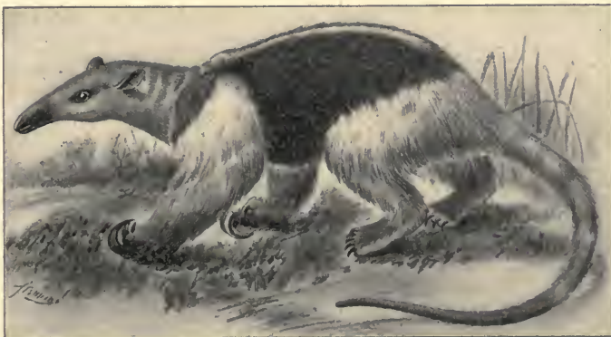
FIG. III. TAMANDUA TETRADACTYLA. THREE-TOED ANTEATER.

Myrmecophaga crispus Rüpp., Mus. Senck., III, 1845, p. 179.